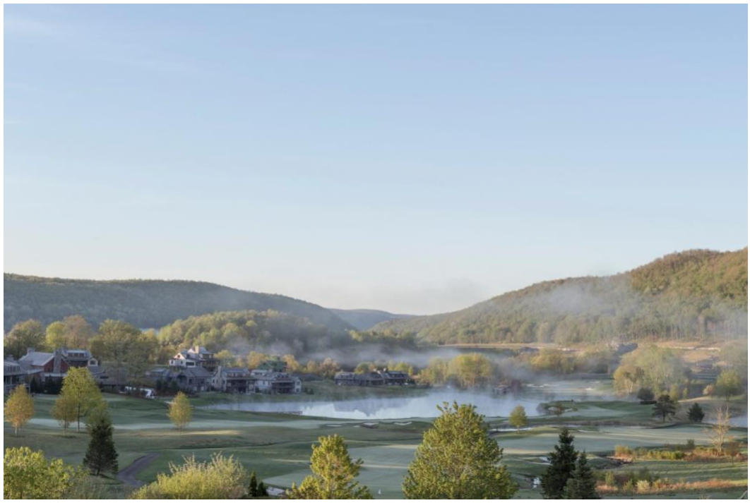
Backyard views from the home.