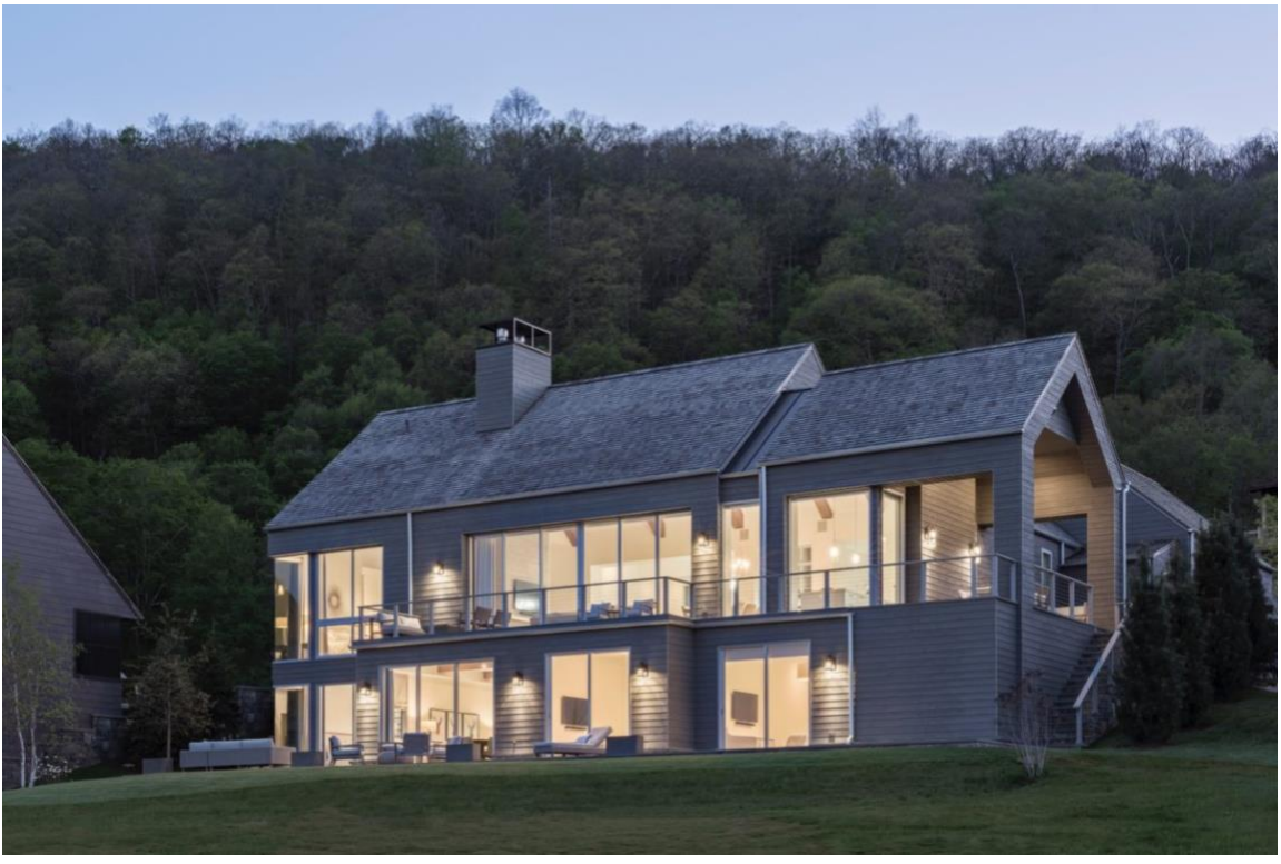
Architecture is by Hart Howerton.