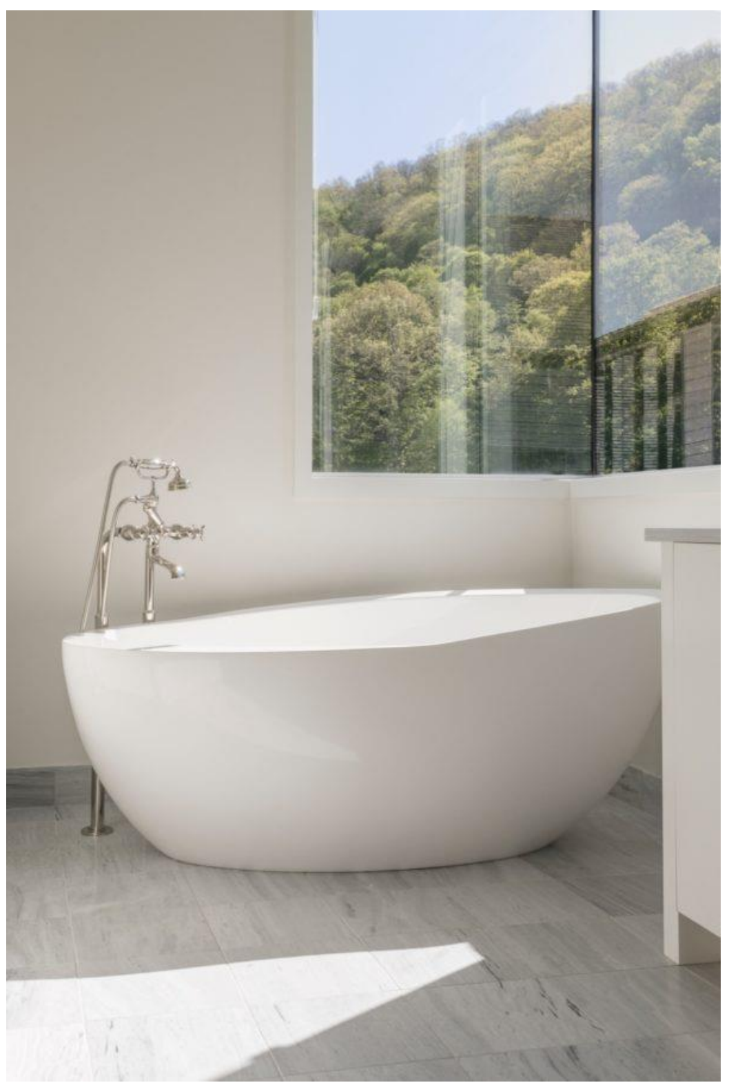
The home features contemporary fixtures.