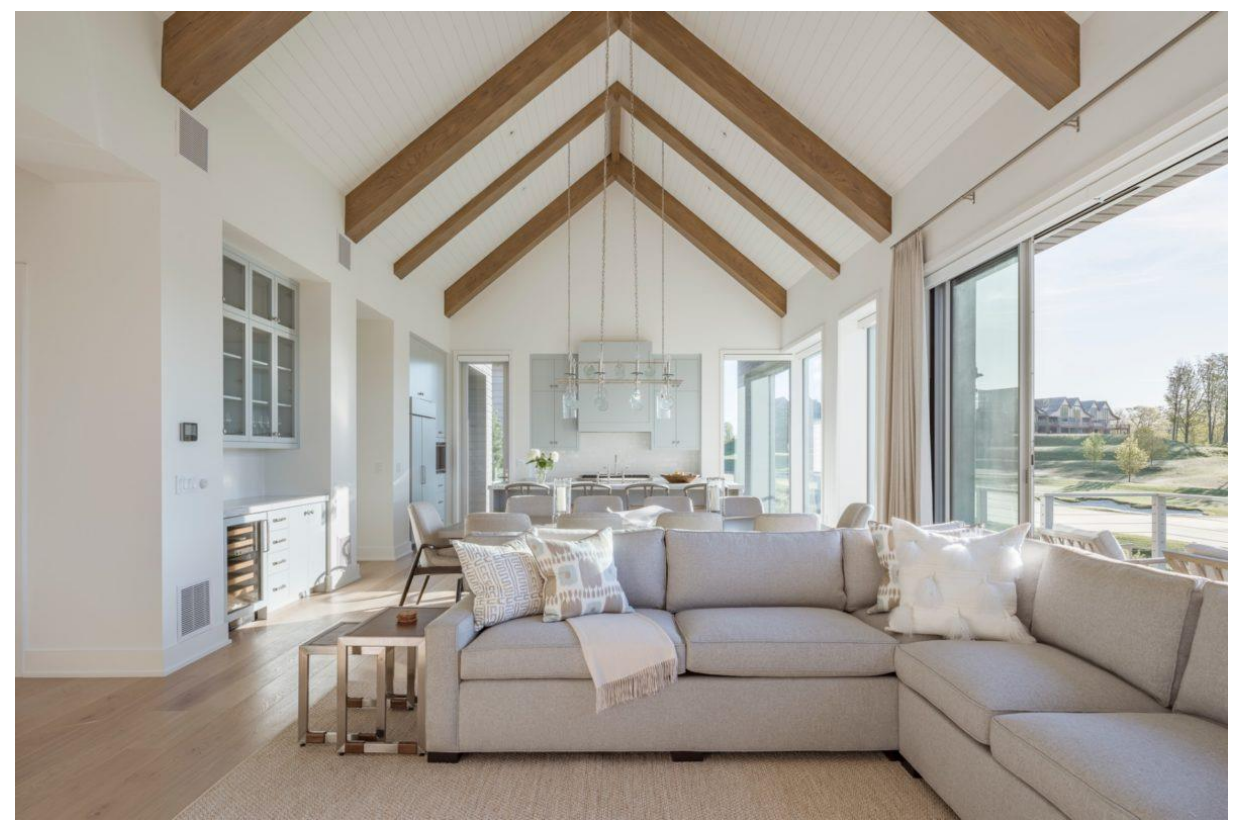
The home is full of private, light-filled spaces overlooking the golf course.