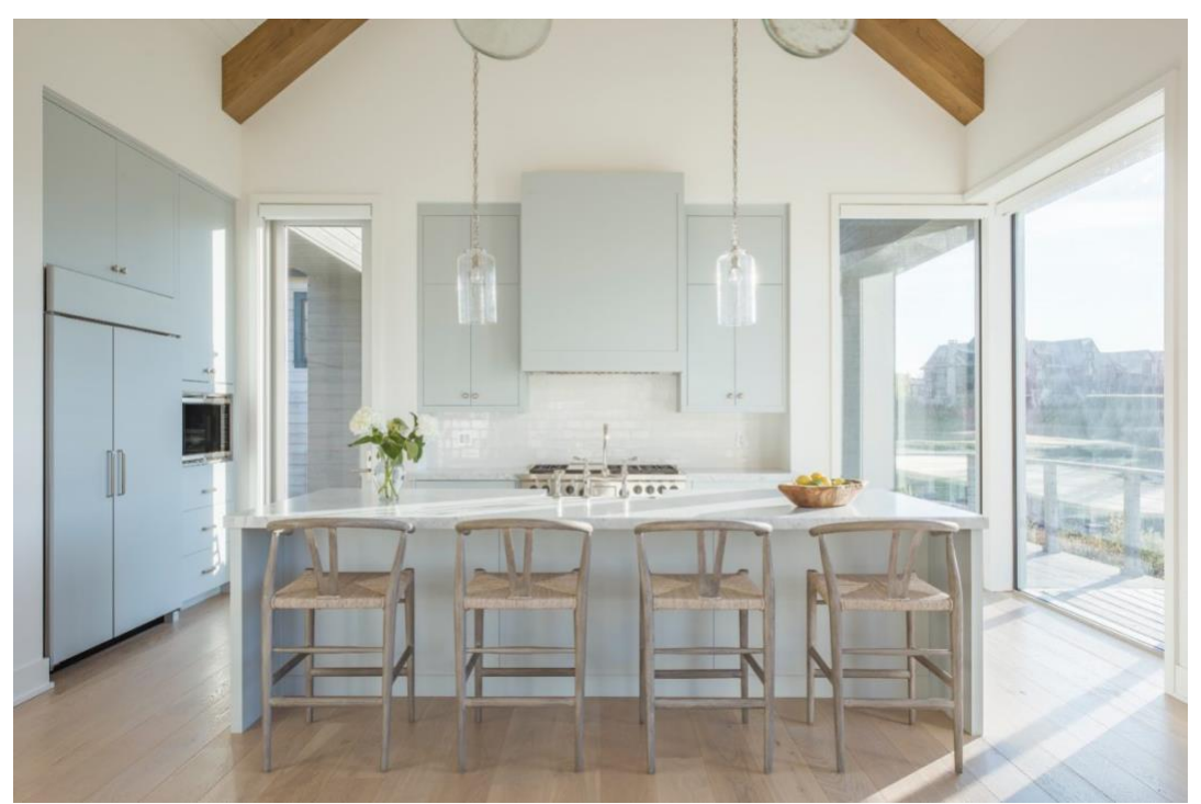
Light, natural materials are used throughout.